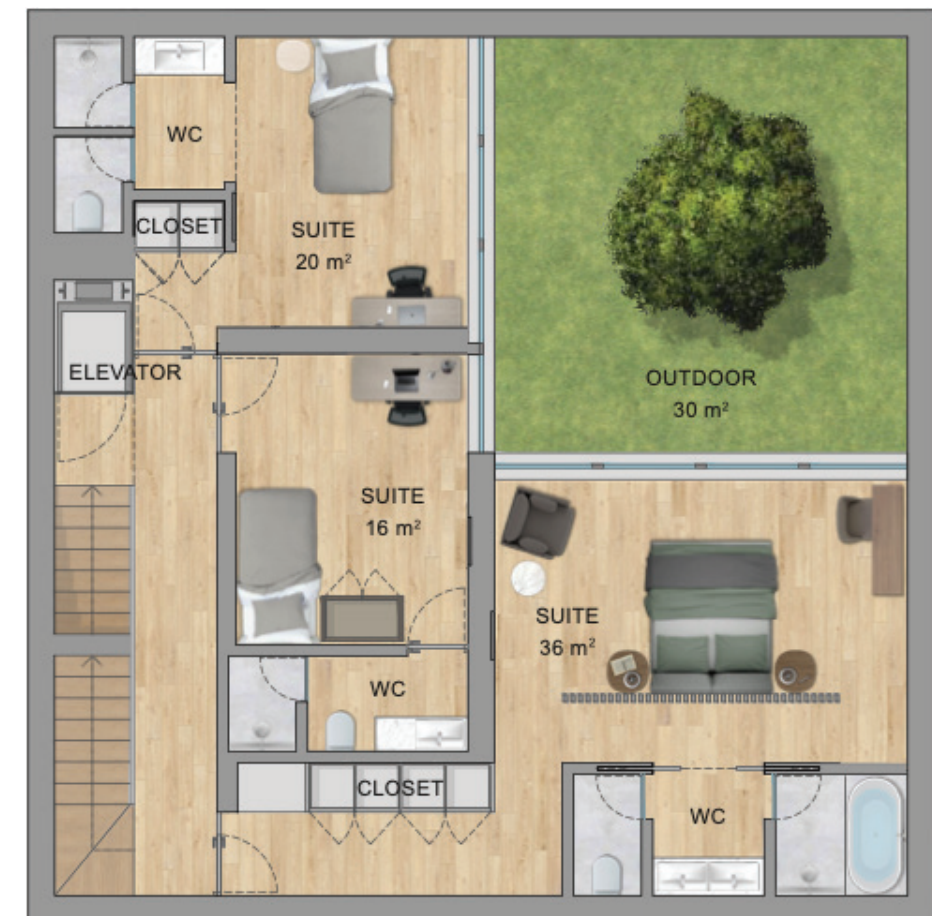
FLOOR 0 | PISO 0