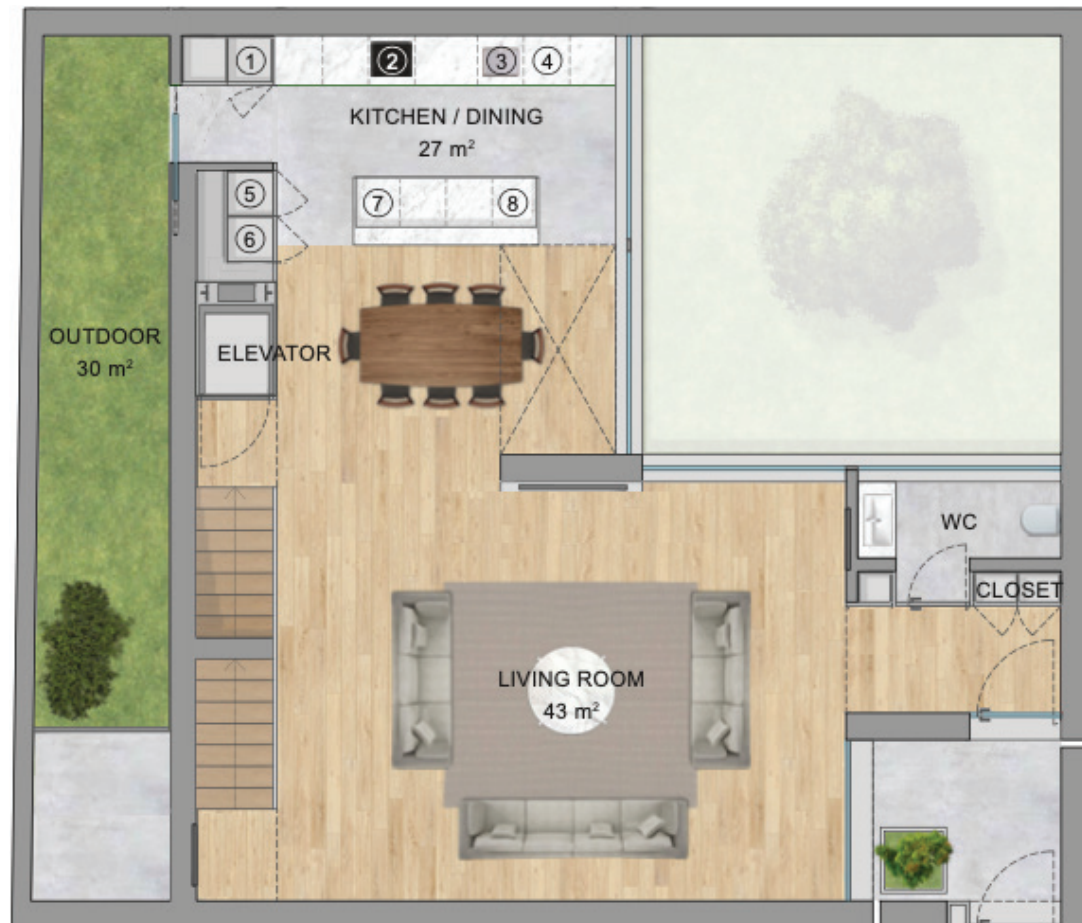
FLOOR 1 | PISO 1