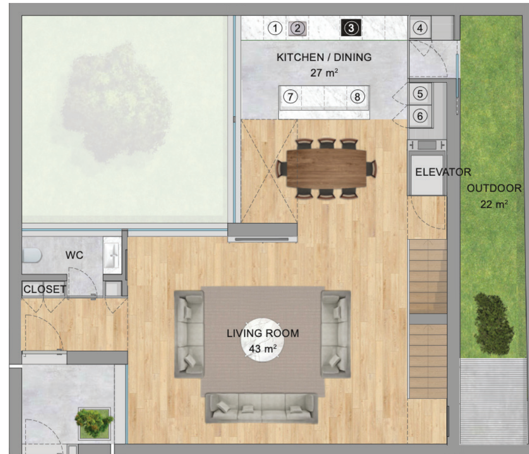
FLOOR 1 | PISO 1