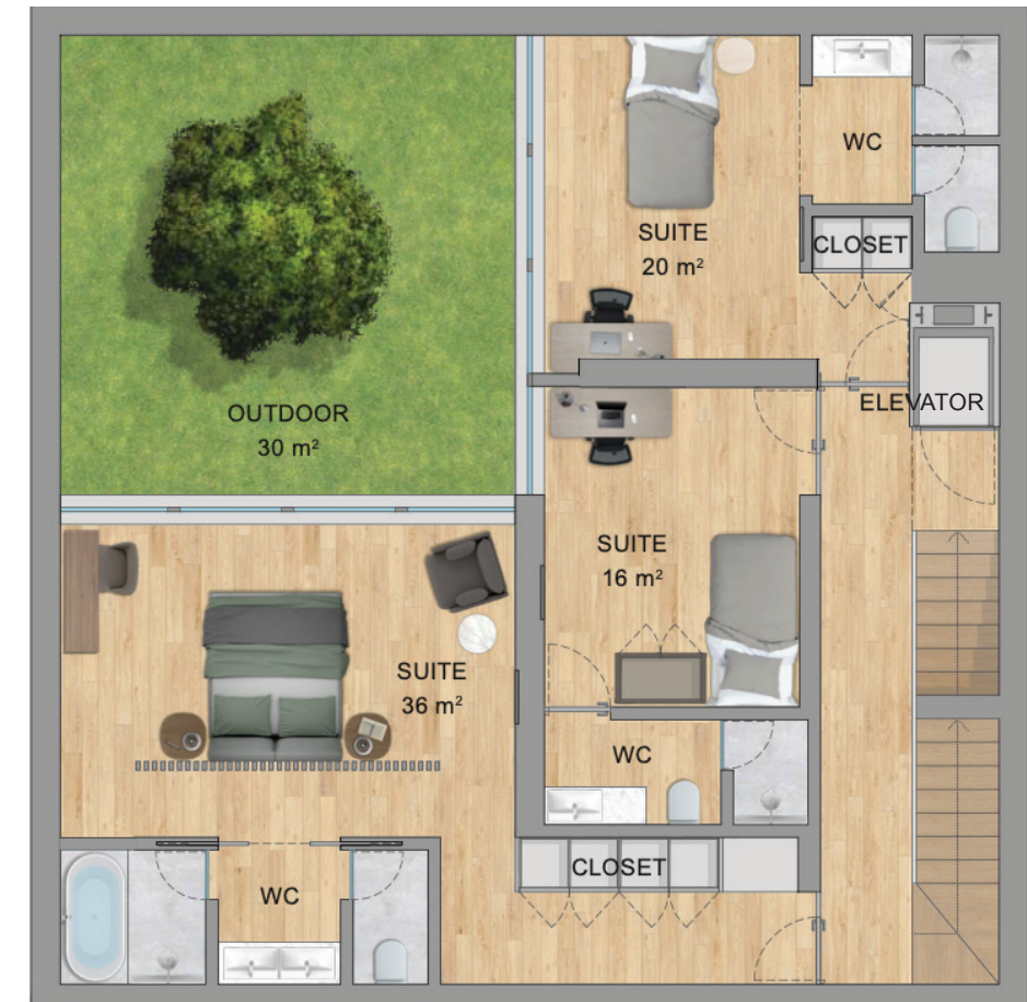
FLOOR 0 | PISO 0